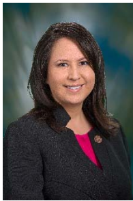
BENALLY, WENONA (D) District 7 Member of Committees on Land, Agriculture and Rural Affairs;

Rules Legislative Council Bills, memorials and resolutions introduced: ADOT licenses; authorized presence repeal (HB 2099) AHCCCS; dental care; pregnant women (HB 2442) ** AHCCCS; waivers; tribal exemptions (HB 2479) appropriation; adult protective services (HB 2505) appropriation; child care subsidy program (HB 2519) appropriation; counties; essential services (HB 2407) appropriation; JTEDs; 9th grade (HB 2391)